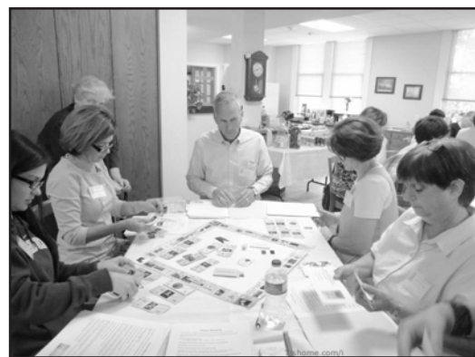
Enjoying a game of "Carmel Monopoly"