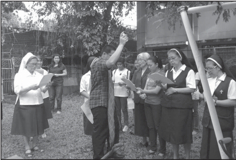
Sisters in Quezon City gather for the ground breaking of the new addition to the Sisters of Mount Carmel Catholic School. The Philippine government has added two years to the high school curriculum. Additional classrooms were needed to fulfill the mandate. The groundbreaking was August 23.