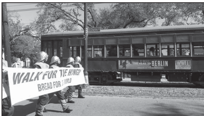
The New Orleans chapter of Bread for the World, a faith-based advocacy group working to end hunger both domestically and globally, held its 34th annual Walk for the Hungry on March 7. The Purple Knights of St. Augustine High School led the walkers along St. Charles Ave.