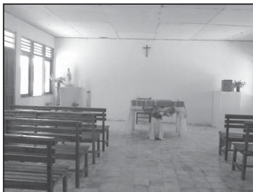
Pictured right: The Sisters of Mount Carmel's mission work in Timor-Leste has been enormously blessed since its foundation on July 18, 2013. The people in Beilaco, Zumalai expressed their gratitude to the people who have been so generous to the sisters for their newly renovated chapel.